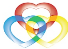
Hearts sharing compassion

Note...this newsletter can be printed out at MAPM.org (on the home page)